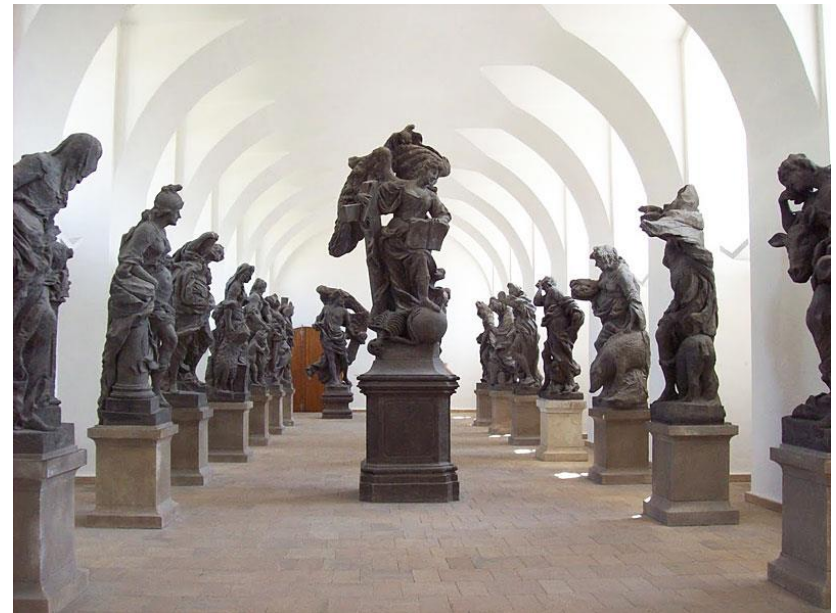
The 12 virtues and 12 vices personified by Mattias Braun in the Lapidarium at Kuks.